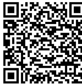
Android Mobile App QR Code