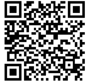
iOS Mobile App QR Code