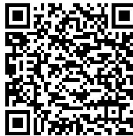
Android Mobile App QR Code