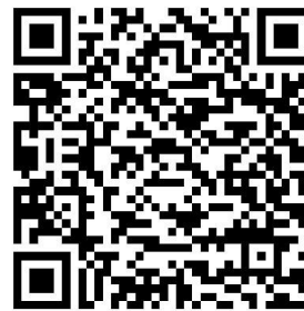
Android Mobile App QR Code